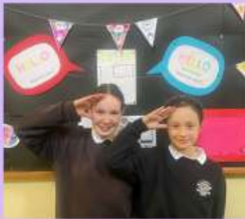
Use Lámh to say hello!

We practised saying hello in lots of different languages, including Lámh!