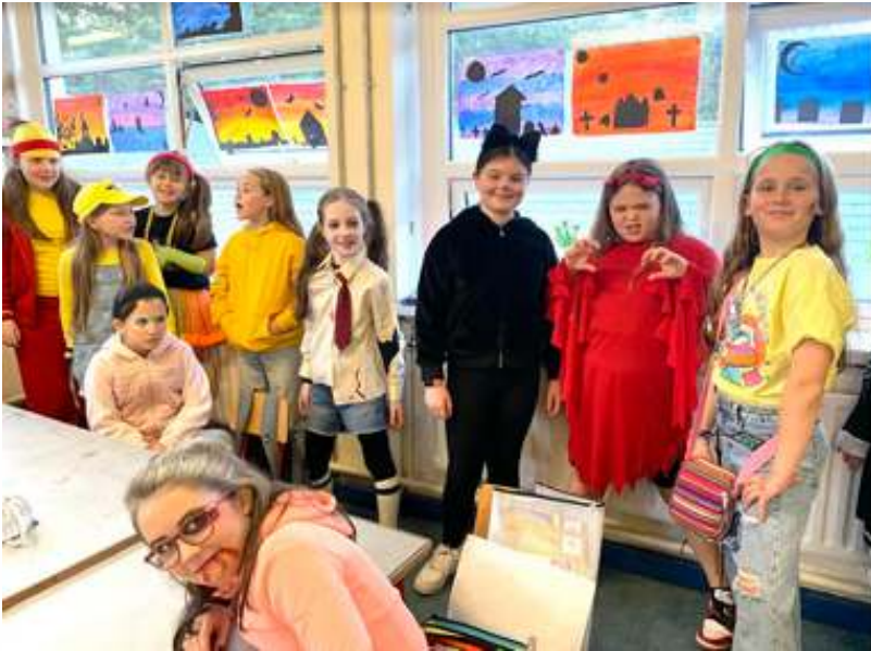
A few of our unique characters in fourth class!