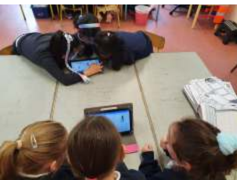
We have also started to learn how to make our own Gaeilge stories using book Creator. We love using our iPads!