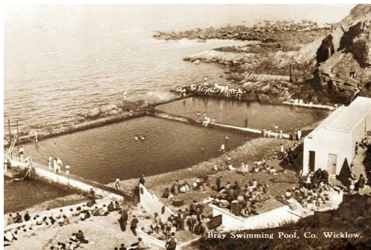
Bray Swimming Pool, Co. Wicklow.